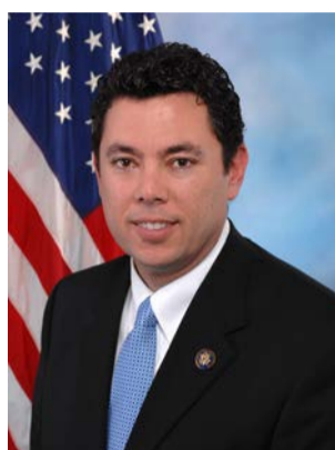
Congressman Jason Chaffetz

We are pleased to announce that this year's keynote speaker will be U.S. Congressman Jason Chaffetz. Representing Utah's 3rd Congressional District, Congressman Chaffetz is the Chairman of the House Oversight & Government Reform