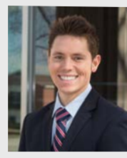
Christopher F. Bond